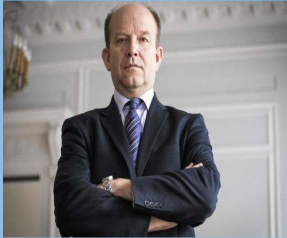
January 2017 Polish Health Minister – Mr. Konstanty Radziwiłł