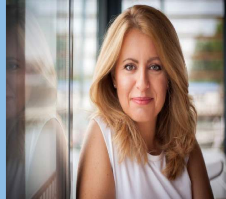
April 2019 New Slovak President – Ms Zuzana Caputova