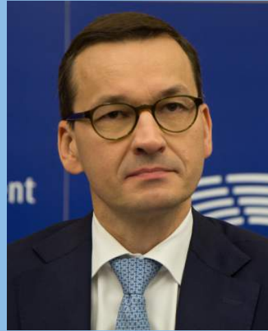
December 2017 Polish PM – Mr. Mateusz Morawiecki